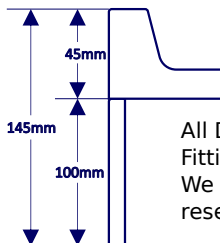
Optional Plinth Kit

All measurement stated in mm to tolerance of +/-5mm