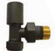
Anthracite Radiator Valves Angled