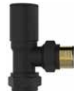
Sorento Black Angled Radiator Valve