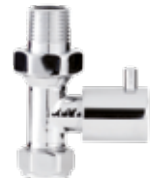
Economy Straight Radiator Valve