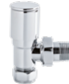
Portman Radiator Valves Angled