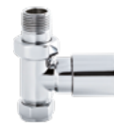
Portman Radiator Valves Straight