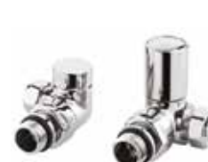
Corner Radiator Valves