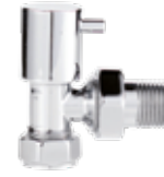
Economy Angled Radiator Valve