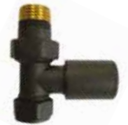
Anthracite Radiator Valves Straight