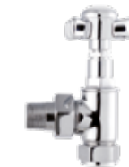
Victorian Crosshead Radiator Valves Angled