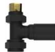
Sorento Black Straight Radiator Valve