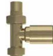
Brushed Brass Straight Radiator Valve