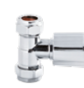
Chrome Radiator Valves Straight