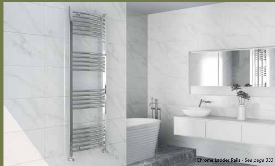
Chrome Ladder Rails - See page 333