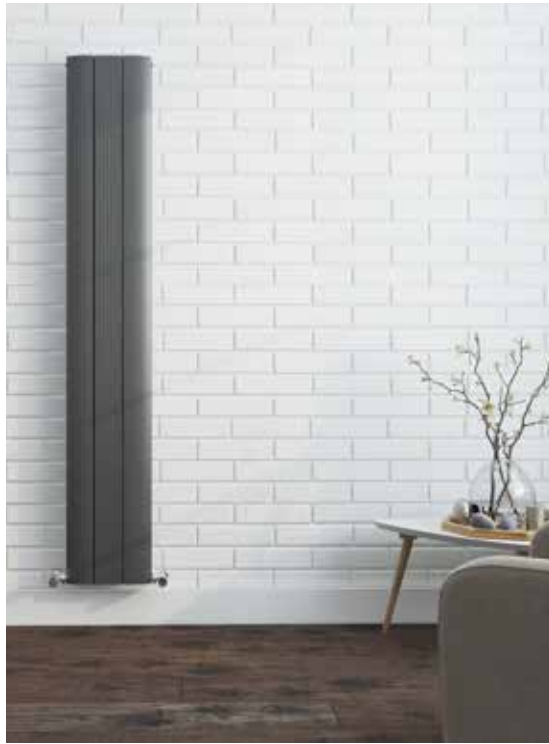
1800 x 280mm Anthracite Radiator without Towel Rail