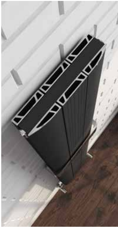
1800 x 280mm Black Radiator with Towel Rail