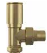
Brushed Brass Angled Radiator Valve