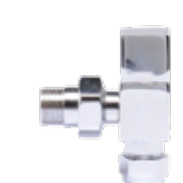
Pure Square Radiator Valves Angled