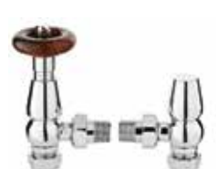
Camden Chrome Radiator Valves