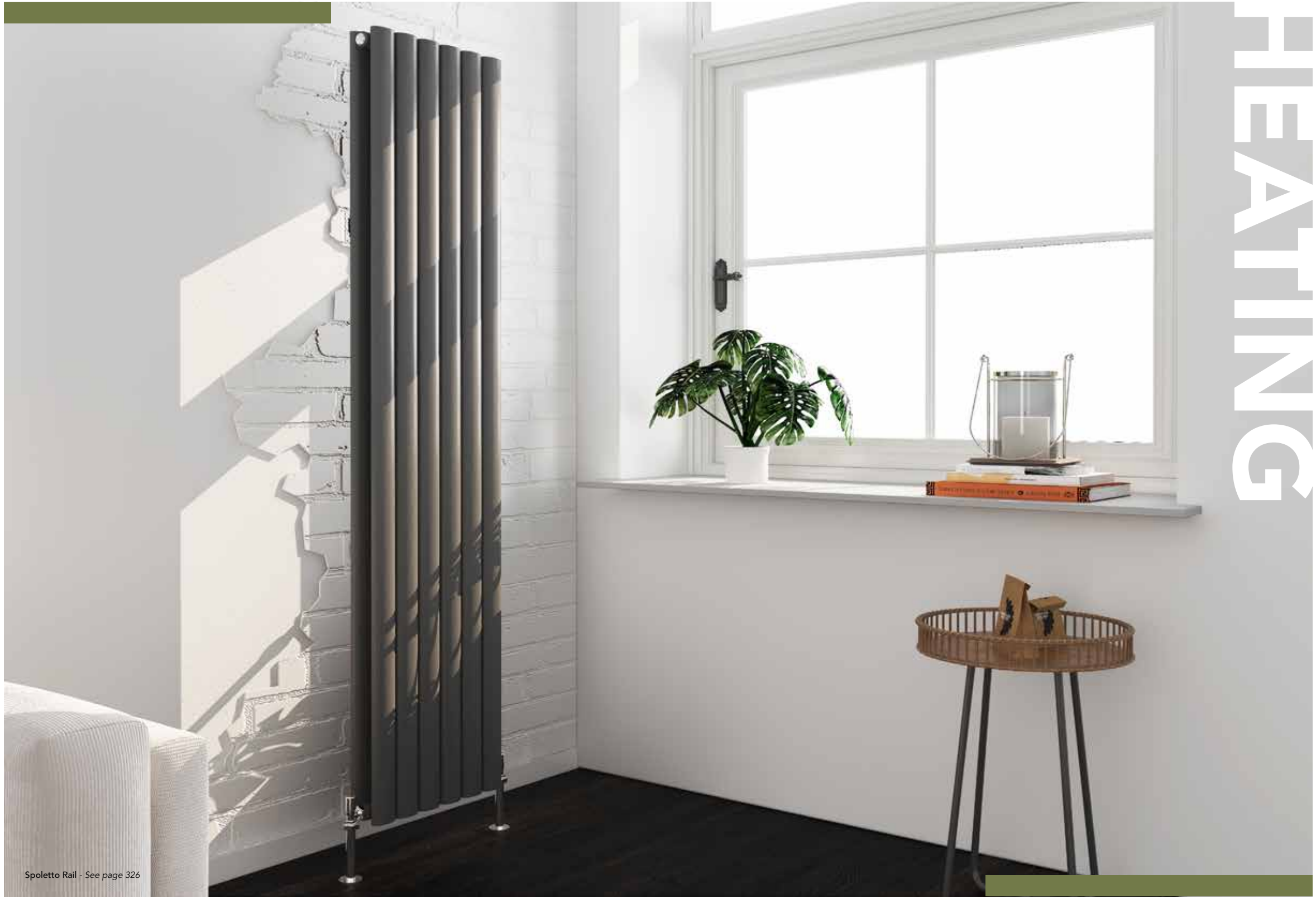
Spoletto Rail - See page 326