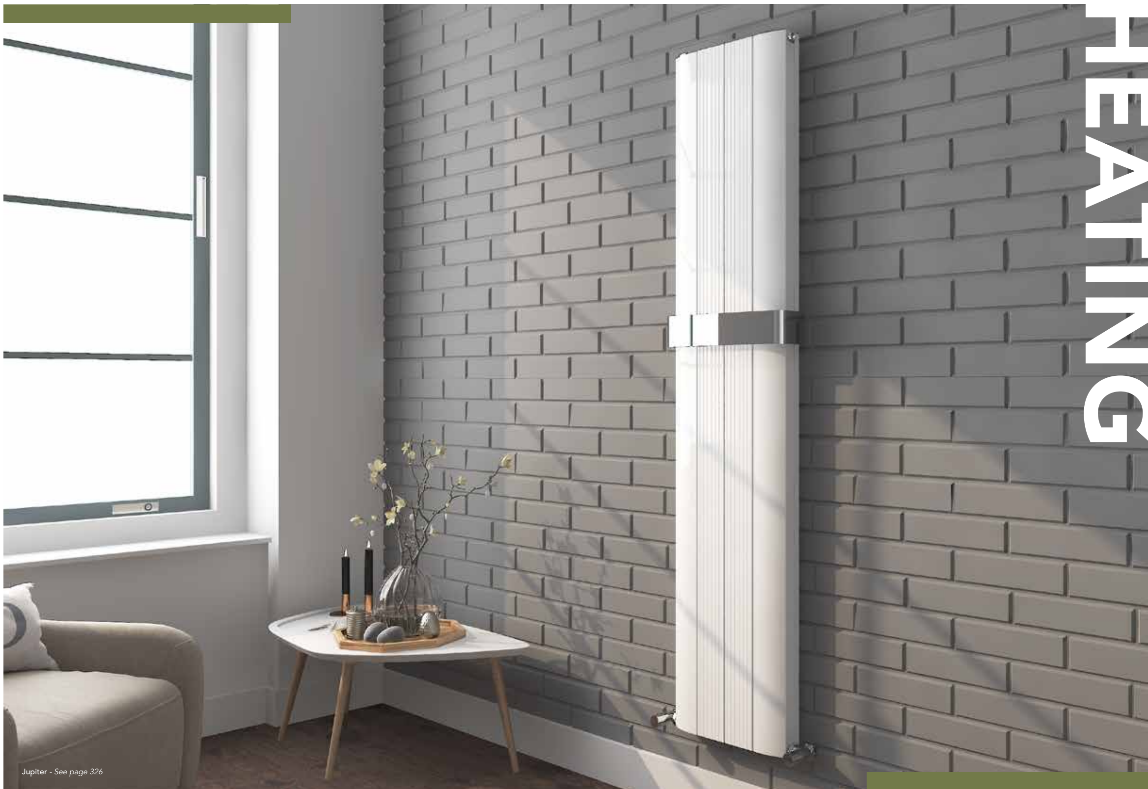
Jupiter - See page 326