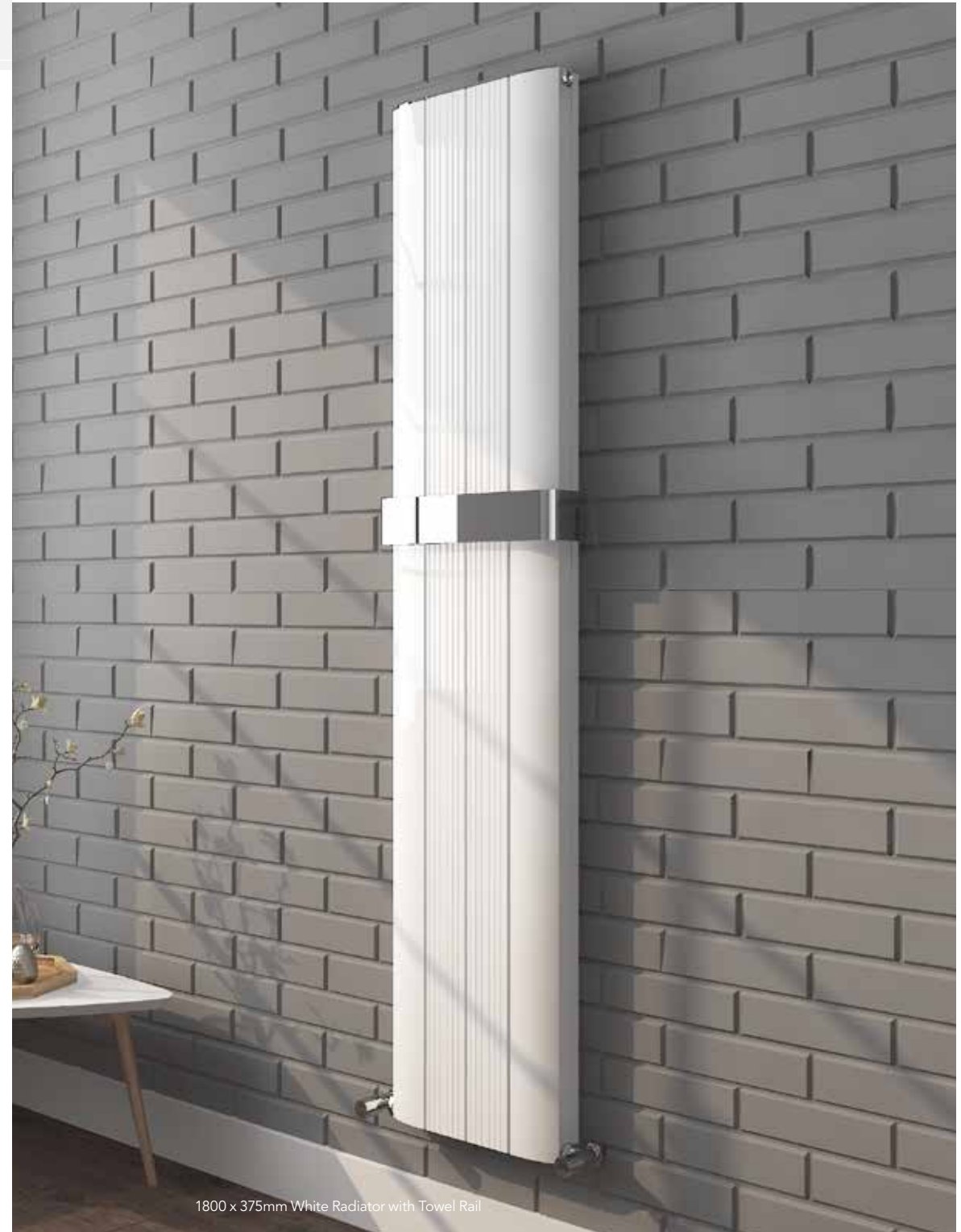
1800 x 375mm White Radiator with Towel Rail