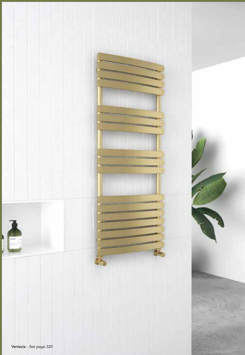
Venezia - See page 320