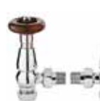
Camden Chrome Radiator Valves