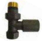
Anthracite Radiator Valves Straight