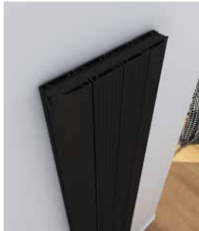
1800 x 280mm Black Radiator