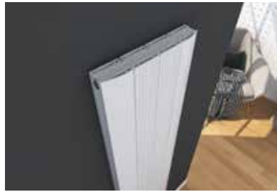
1800 x 280mm White Radiator