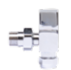
Pure Square Radiator Valves Angled