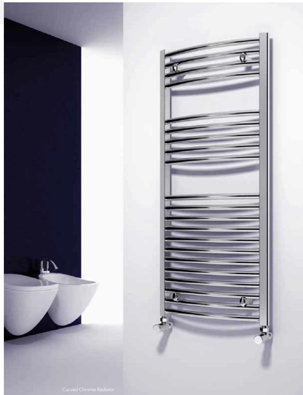
Curved Chrome Radiator