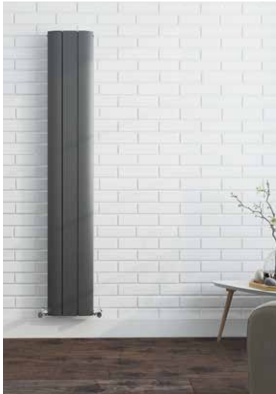
1800 x 280mm Anthracite Radiator without Towel Rail