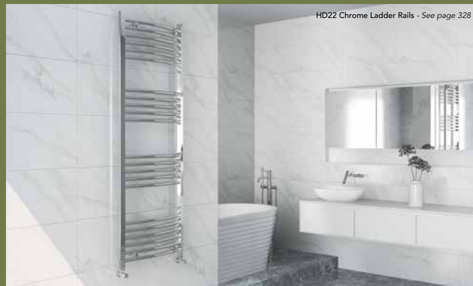
HD22 Chrome Ladder Rails - See page 328